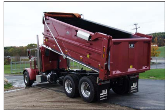
J&J dump bodies set the standard for quality and reliability.