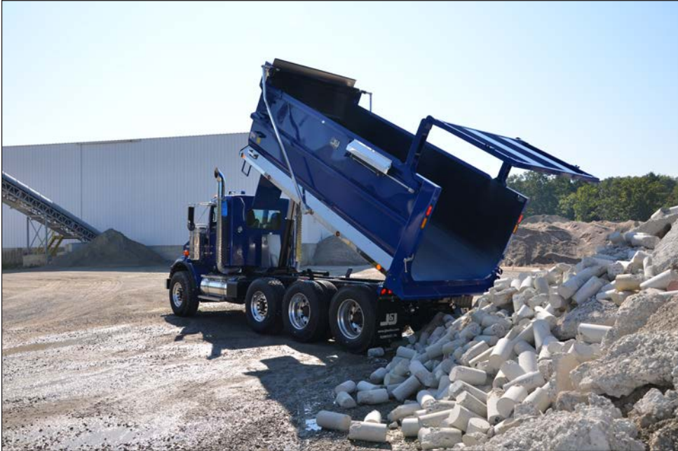
The Air High Lift Tailgate option prevents tailgate damage from large objects and functions as a conventional tailgate for standard dumping applications.